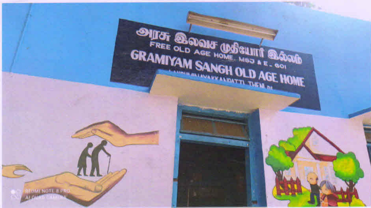
Senior citizen home for elders (IPSec)

Gramiyam Sangh is a nonprofit organization functioning from 1996 for the development of rural people of Theni, Dindigul, Madurai, karur, Sivagangai districts of Tamilnadu. We are working for the development of the oppressed people of the society. With the generous support of central government, state government and local founds we are running various programmers for the rural development. In this statement let us view our last year performance at a glance.